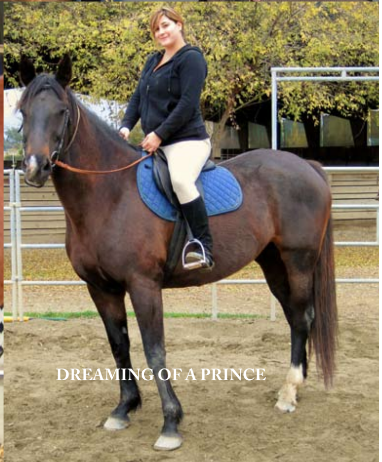
DREAMING OF A PRINCE