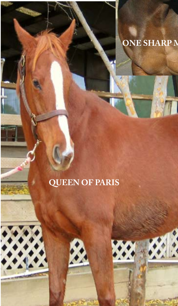
QUEEN OF PARIS