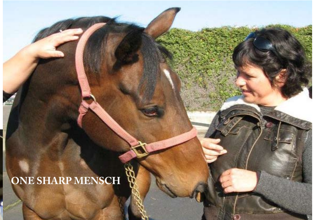
ONE SHARP MENSCH

NEIGH SAVERS TB RESCUE HORSES NOW AT HOSSMOOR